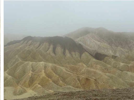
Zabriskie point and Artists Pallete