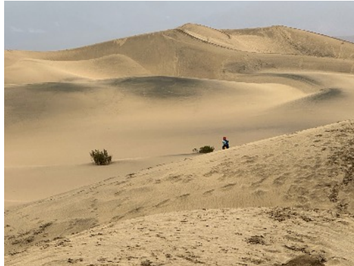
Mesquite Flats sand dunes