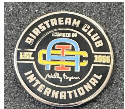
The new ACI Collectors pin