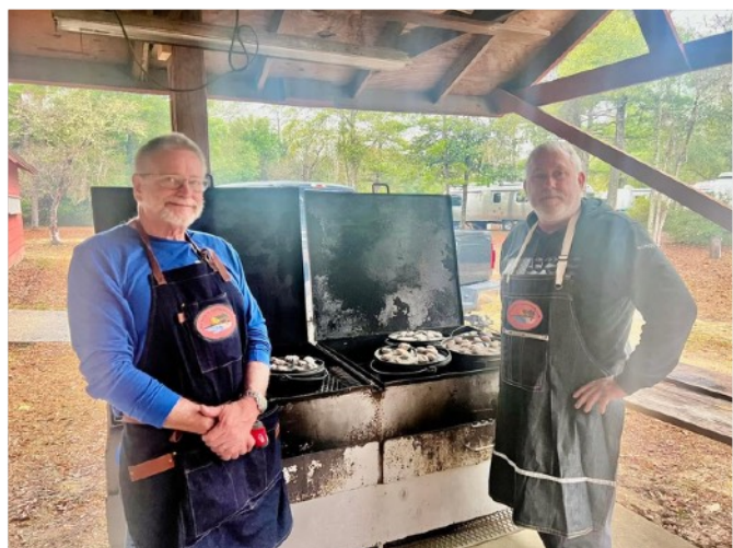
The Big Bend Club enjoyed Dutch Oven Cooking at their Rally "Let's Go Camping" held at Mystic Springs