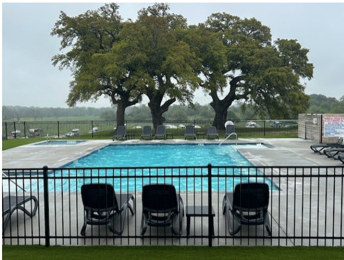
The Hill Top Resort Brenham, TX