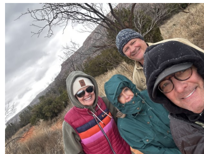
Yes - snow flurry's!!