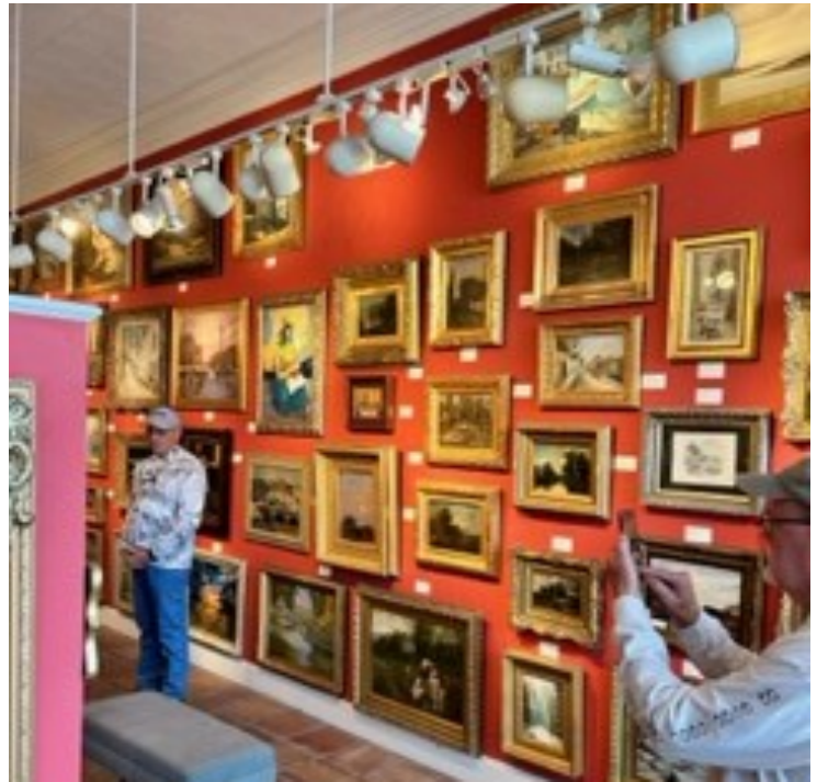
Ramsey Art Collection