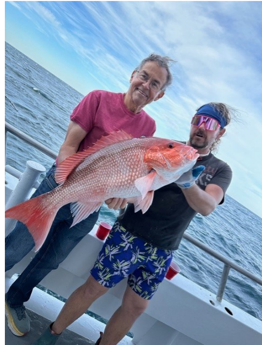
Took a while to land this 28 lb. Red Snapper