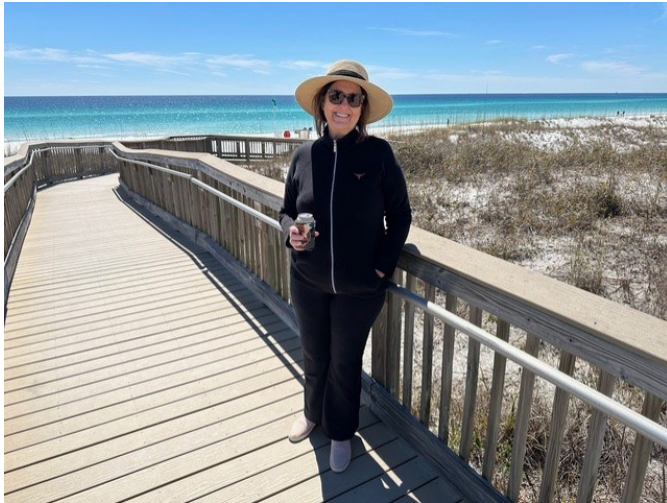
Emerald water on the Emerald Coast of Florida

We stayed at Henderson State Park on the Emerald Coast right in downtown Destin. Beaches were beautiful and I went fishing. Caught a lot of little ones and this one nice Red Snapper.