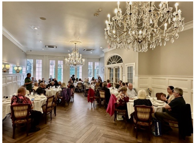
Court of Two Sisters

Wonderful times, marking new friends from all around the country.