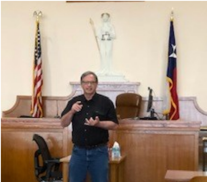
Tour of the Hill County Courthouse