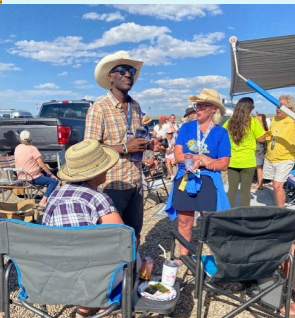
Rock Springs, WY