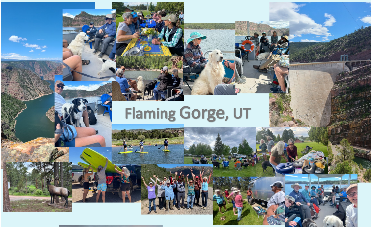
Flaming Gorge, UT