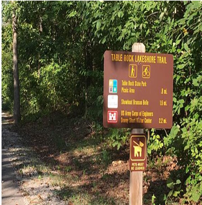
Table Rock Lake State Park and environs host lots of outdoor activities, including miles of hiking trails, boating, kayaking, and paddle boarding. Branson, famous for its music halls and theaters, is just a short distance away. Should you care to bend an elbow, the area boasts several distilleries and wineries.

In the meantime, I'm researching other activities and fun things in the area. Schedule is forthcoming but there is no shortage of things to keep us occupied.