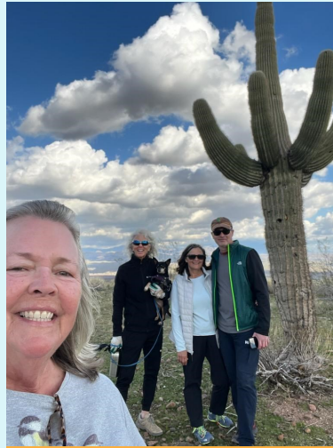
Ft. McDowell, AZ