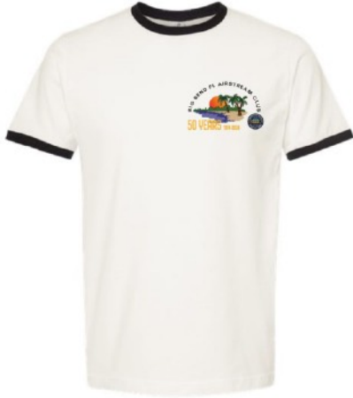
UNISEX RINGER TSHIRT