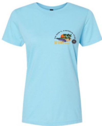
WOMENS AQUA BLUE