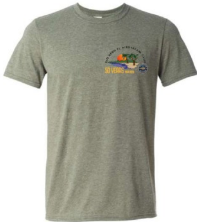
UNISEX HEATHER GREEN