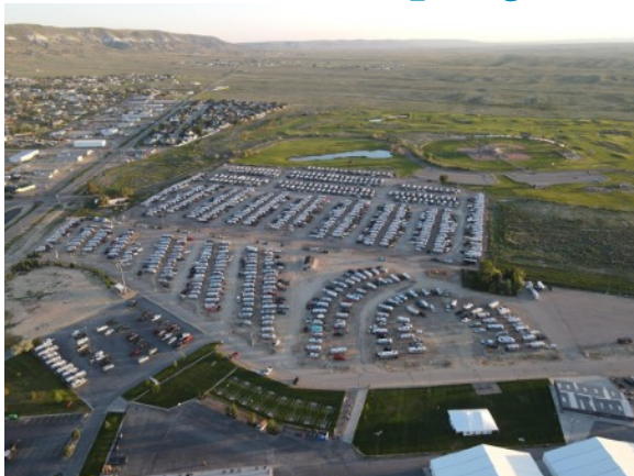
Photos: Rock Springs, WY- International Rally 2023

Get ready for all the treasured traditions of adventure and friendship at ACI Rally2024, coupled with the fantastic tastes, sights, smells and temperatures of fall in the Midwest