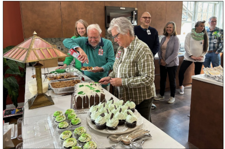
Yeah - not too many calories in those desserts - Yummy!

A priest is driving back to Dublin when he gets pulled over for speeding.