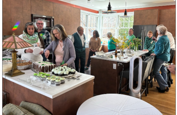
No one could skip this line, more than enough for all and many more!