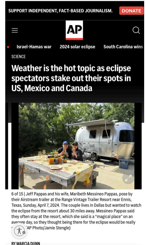
Screenshot of the AP eclipse article