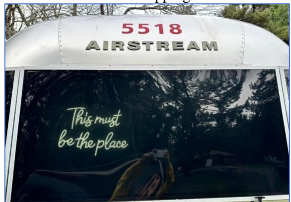
It WAS the place!!