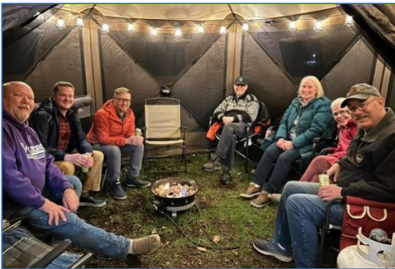
Those who chose to stay warm in the Clam shelter...