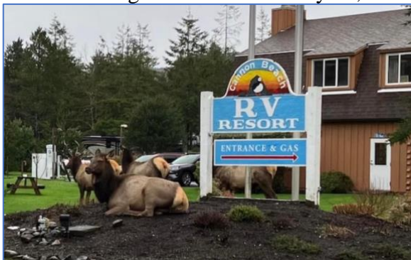
Elk welcoming committee as we arrived.