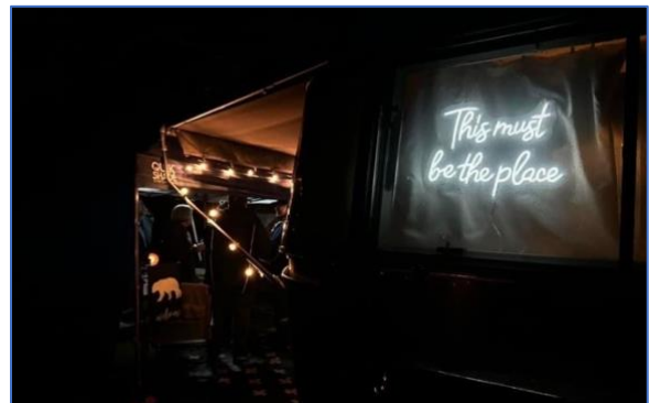
All cleaned up, another great rally in the books.