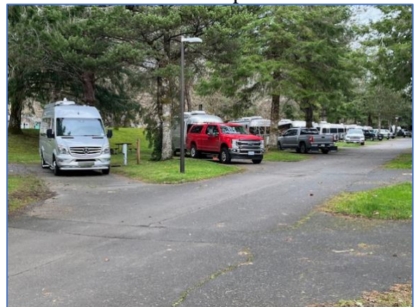
After everyone who could attend arrived. Nine units total. Sure missed those who couldn't make it!