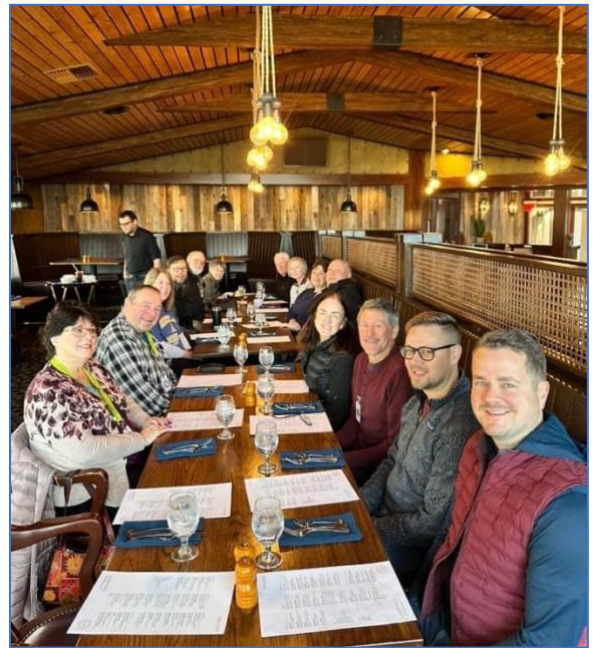
Dinner was great. As usual, enough food for an army! Breakfast out at the Wayfarer. Yum! Great company.