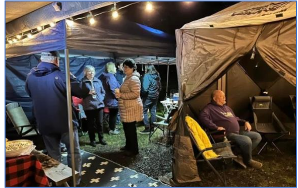
Staying dry and having a great evening of friendshipping!