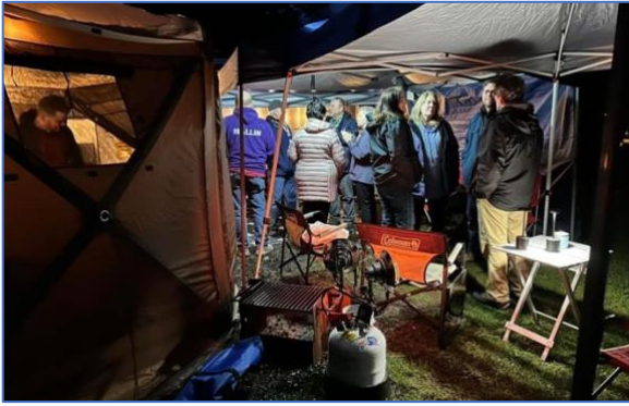
Still no leaks!