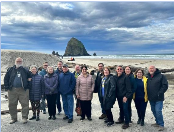
Most of us at the beach in front of the place we had breakfast.