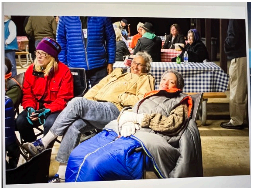
Photographic evidence of the campfire circle during the Tanglewood Freeze. Just ask anyone pictured how cold it was.

hoodie, glove, and hat that we could find. S'mores never entered anyone's mind. That would have involved moving from the chair we had just warmed up. My grand plan to cook grits for all campers on Sunday morning was canceled by unanimous decision. Frost covered the frozen ground. (Maybe I'm exaggerating slightly on the ground part. But it was COLD.)