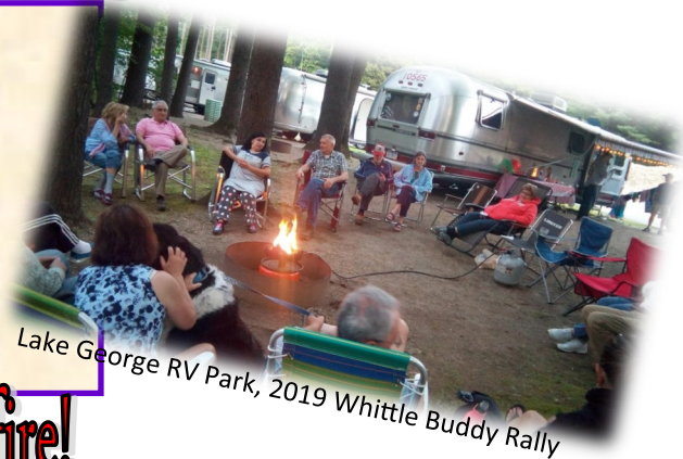
Lake George RV Park, 2019 Whittle Buddy Rally

Looking forward to seeing you at the campfire!