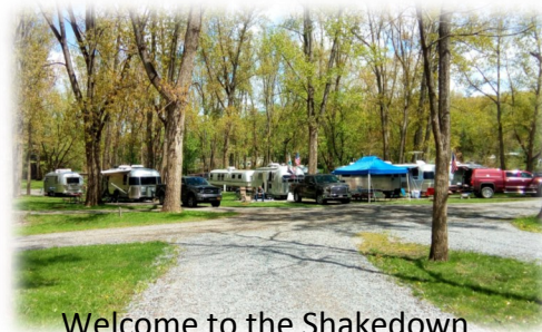
Welcome to the Shakedown