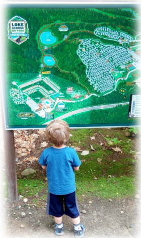
Philip checks out the Park map

Please note next year the rally weekend will be May 28 - 31. Hope to see you all down the road.