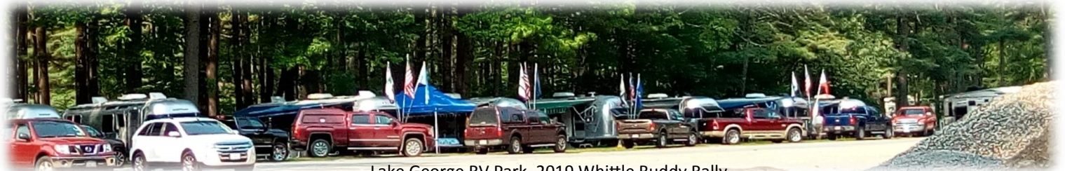
Lake George RV Park, 2019 Whittle Buddy Rally