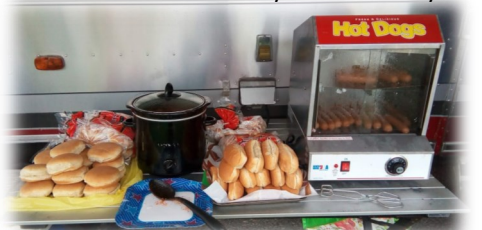
Hot dogs, get your hot dogs here!