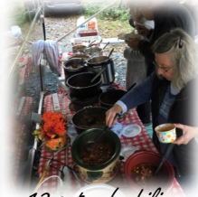
12 pots of chili