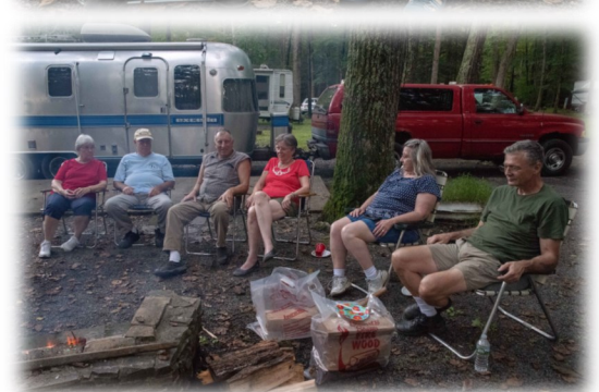
Good times around the camp fire