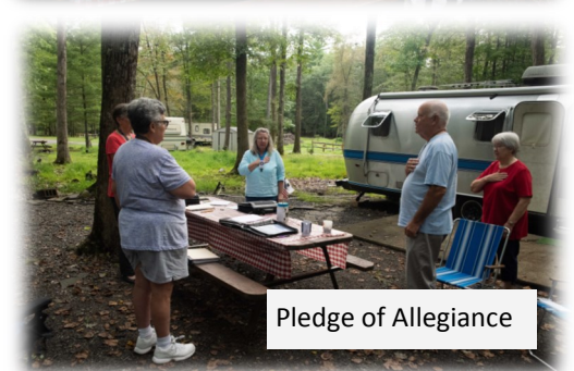
Pledge of Allegiance