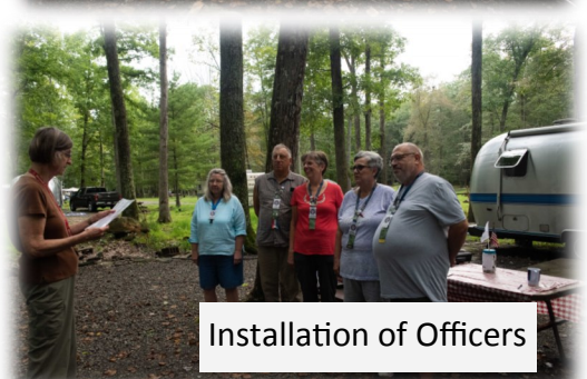
Installation of Officers