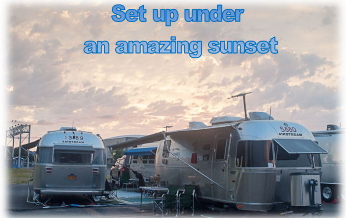
Set up under an amazing sunset