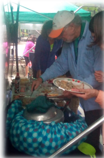
The Wonder Bag