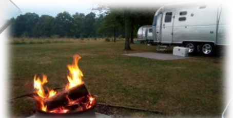
Campfire at Sampson State Park, July