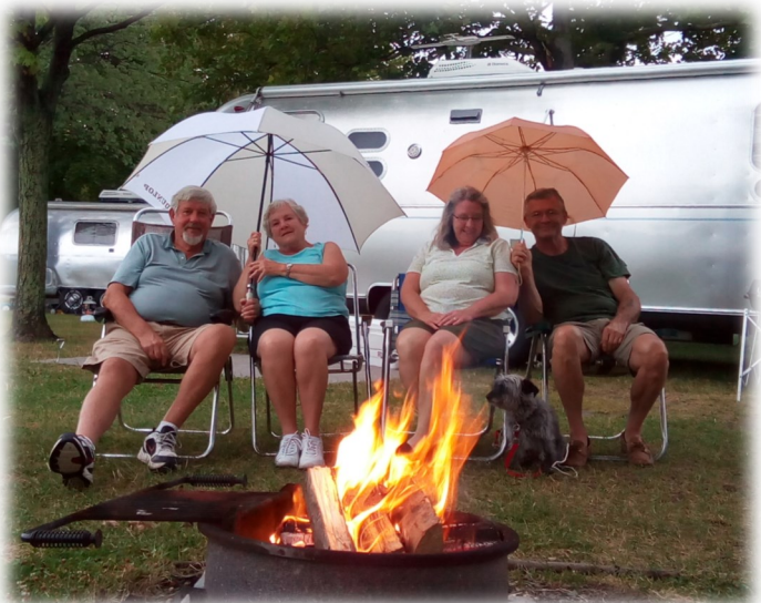
Umbrellas & Drinks by the fire