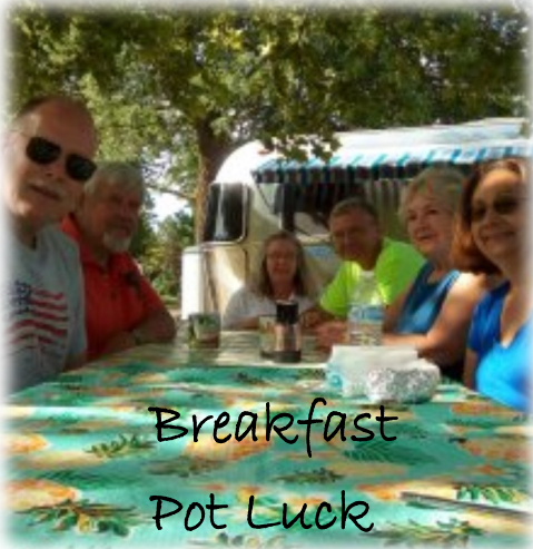
Breakfast Pot Luck