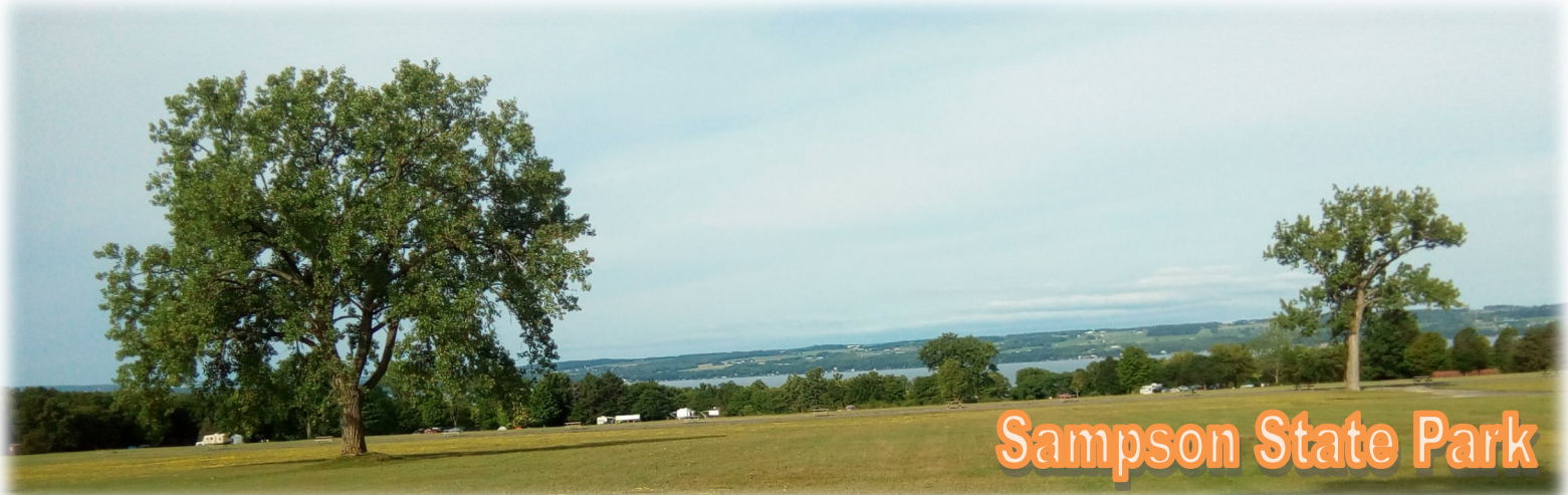
Sampson State Park