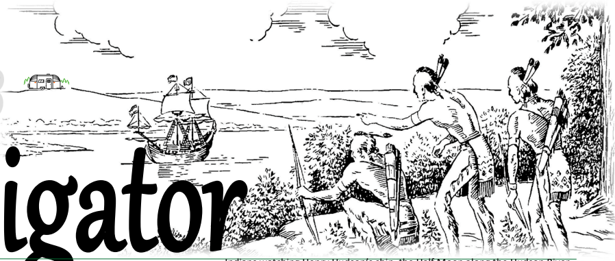
Indians watching Henry Hudson's ship, the Half Moon along the Hudson River