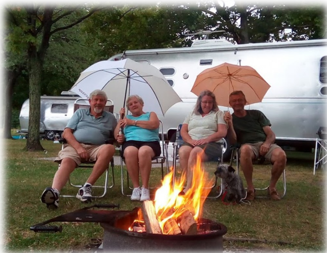
Sampson State Park, July 2018