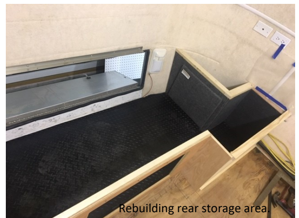
Rebuilding rear storage area.