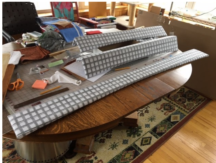
Recovered window cornices waiting to be installed in remodeled bedroom.