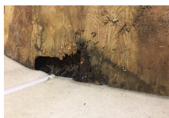
Rotten floor found under the carpet.