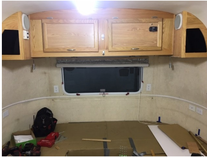
Top cabinet mostly done, new window shade up.