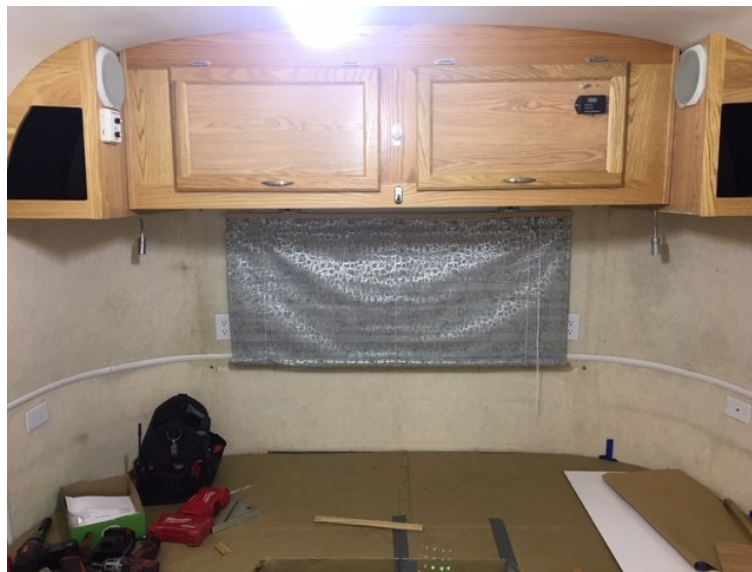
New window shade down.