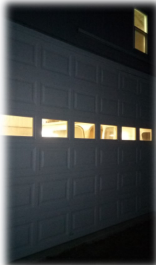
Working late in his work shop