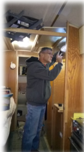
Installing the new antenna