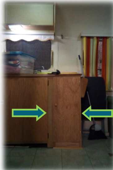
New cabinet next to sink, more storage and counter space