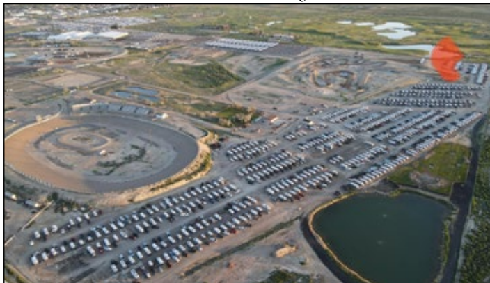
Our group was parked in the red area of this picture.