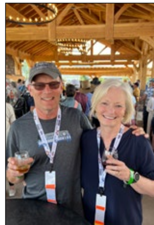
We participated in the Grapes and Grains event which was a lot of fun. We brought some Fargo products to share.