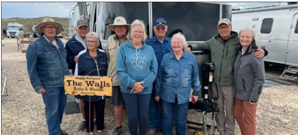
The whole crew from our group.