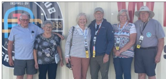
Partial group photo (in that cool picture spot again!)