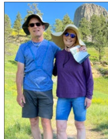
We stopped at Devils Tower on the way home. A very cool stop.