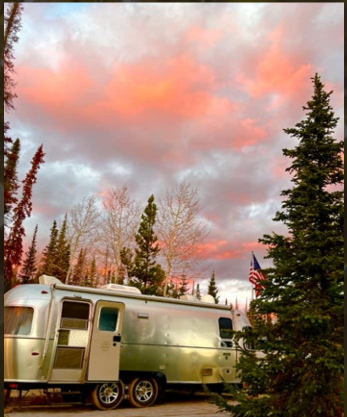
Camping at Ryan Park Campground in Wyoming