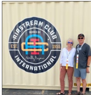
A cool picture spot