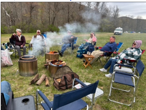
Jason's pellets provided a smoke screen at first lighting, but then worked well!