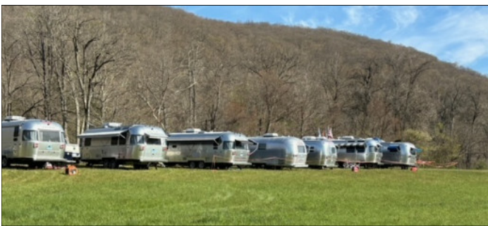
A perfect field to camp in Kent, on a little knoll right next to the Housatonic.