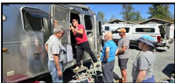
Fixing a very loose door hinge