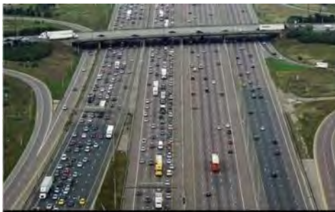
The widest motorway in the world is located in Ontario, Canada. At its widest point, this highway has 22 lanes.