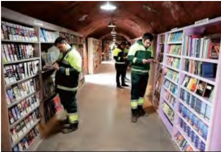
Turkish garbage collectors opened a library with all of the books people throw out in their trash.