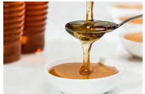
There isn't enough water in Honey for microorganisms to live on, which is why honey never goes bad.