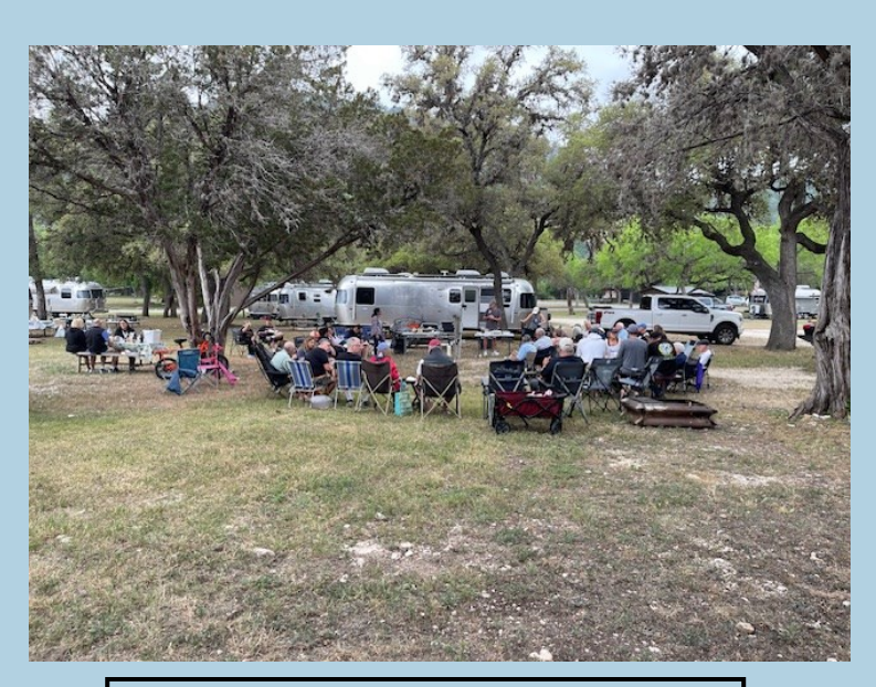
Book Club Topic Discussion