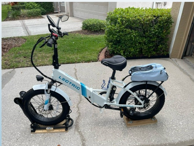
Bike has 17 Miles