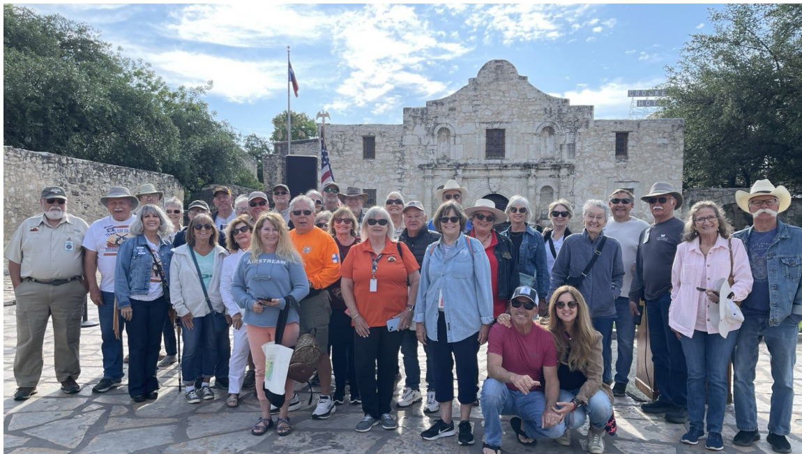
Six Shooters at the Alamo, San Antonio