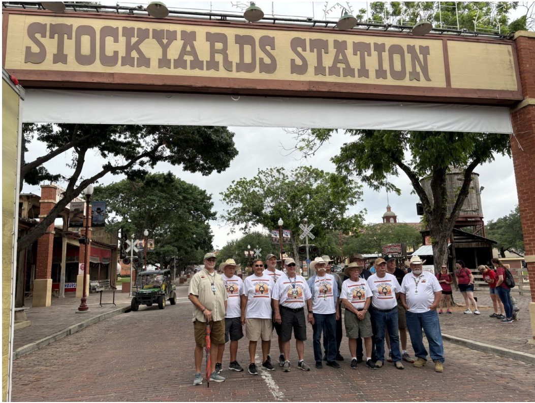
The men at Fort Worth Stock Yards