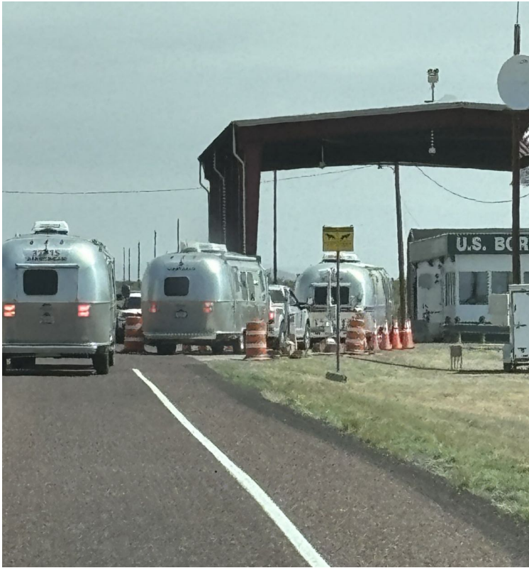
Caravanning through an immigration check-point