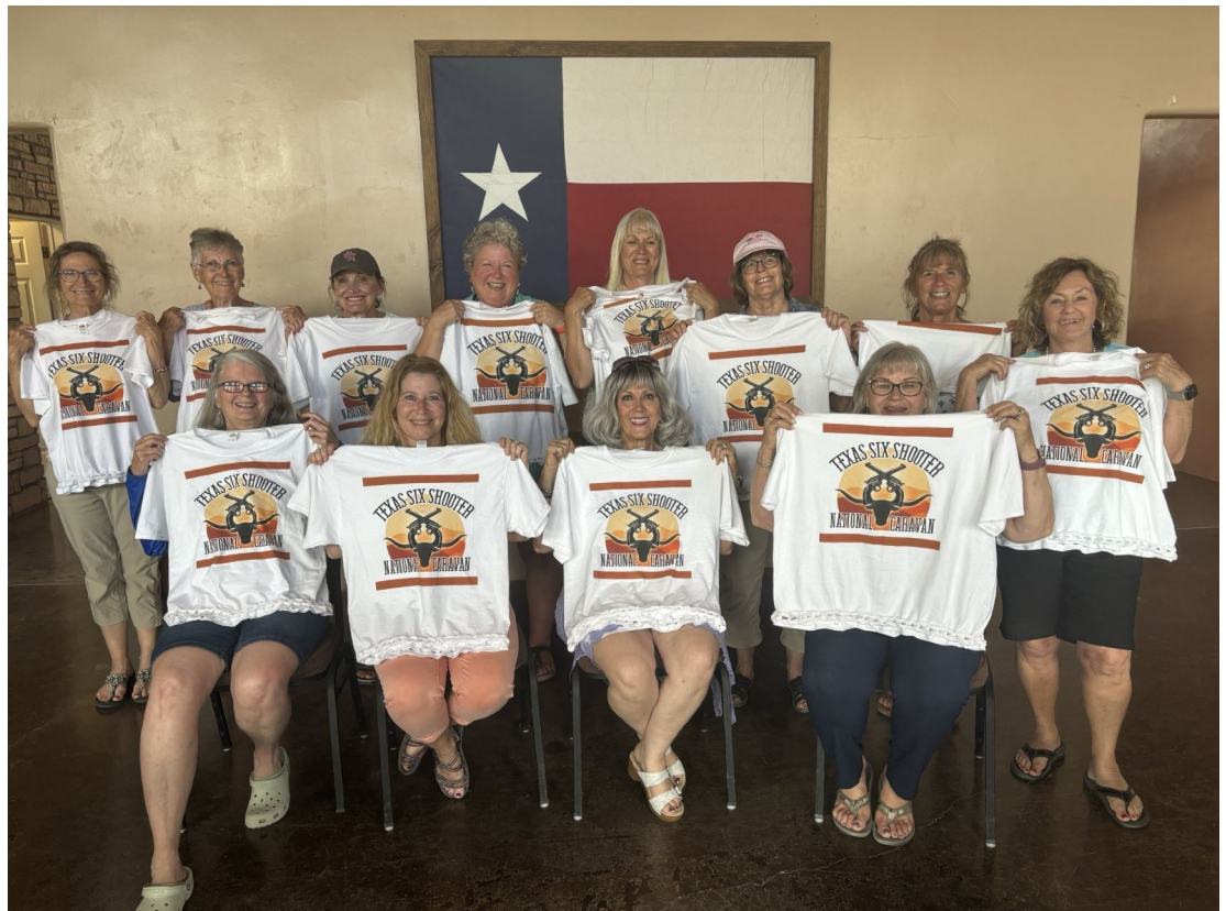
The ladies braiding their Texas Six Shooter t-shirts