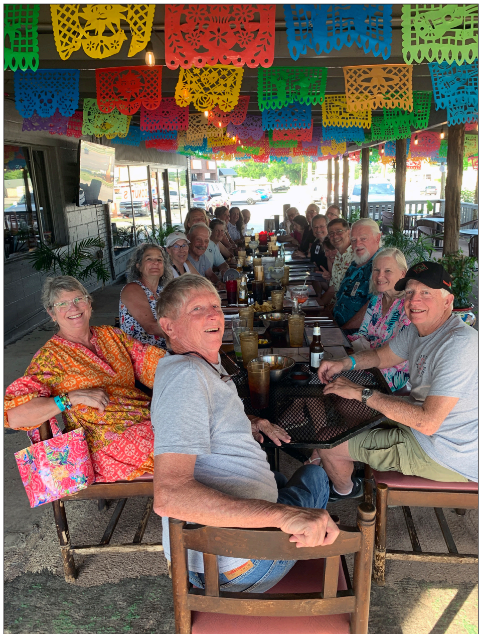
Mama Mia, what a group! Dinner at Mama Mia's in Glen Rose