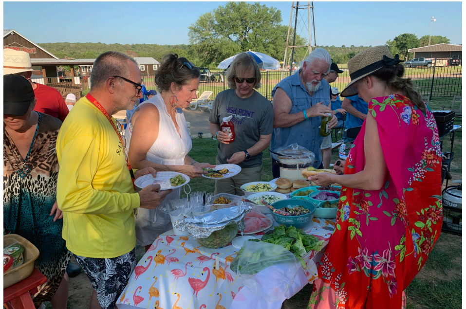
Plenty of delicious food for our Friday evening dinner!