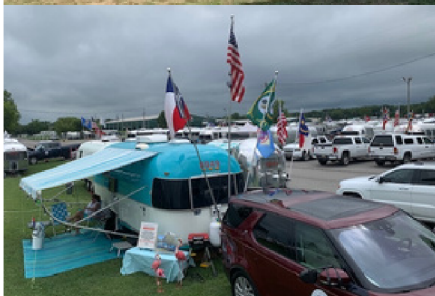
Gnome Away From Home