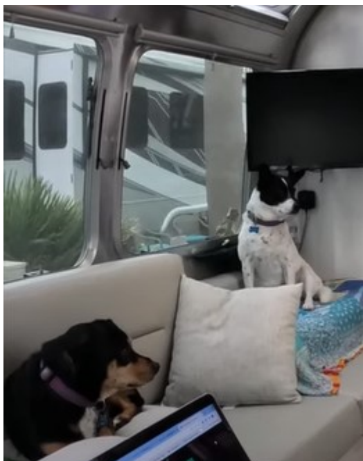
Buttons (bottom left) and Lacey (top right)

We spent a month on the road last spring exploring Central and West Texas. The trip was full of highs and lows, but the city of Alpine was a standout winner. We'd love to take the Airstream up to Boise and spend a winter skiing ASAP! A fall trip to New England would be amazing too.