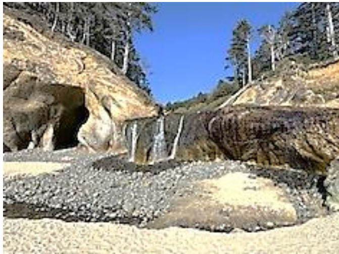
Hug Point Falls.

Nearly every stretch of beach has at least one fresh-water stream running into the ocean. Fall Creek, near our friends' cottage, fell gently over a seven-foot ledge of rock onto the sand at Hug Point Falls. Hug Point itself, just a hundred yards north, is a volcanic headland that separates Arch Beach from Cannon Beach. Even at low tide the water at the point is ten