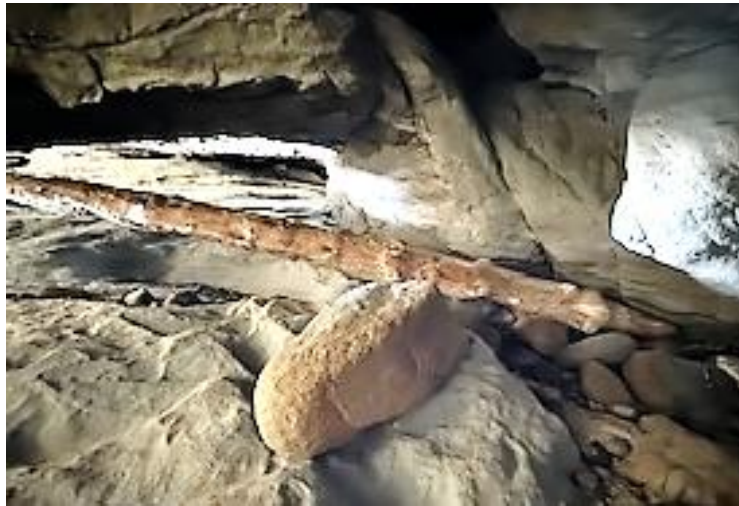
Forty-foot log jammed deep in a seaside cave at Hug Point.

Nearly every stretch of beach has at least one fresh-water stream running into the ocean. Fall Creek, near our friends' cottage, fell gently over a seven-foot ledge of rock onto the sand at Hug Point Falls. Hug Point itself, just a hundred yards north, is a volcanic headland that separates Arch Beach from Cannon Beach. Even at low tide the water at the point is ten