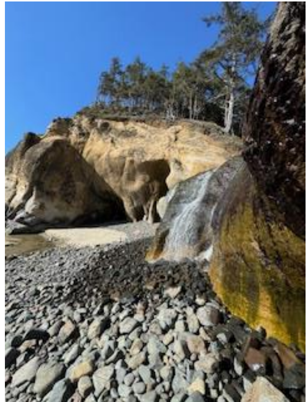
A view from the beach of Hug Point State Park, Oregon. Hug Point Falls is in the foreground, one of the sea caves in the background. The Pacific is just to the left

The northern hundred and fifty miles or so of the Oregon shoreline was formed by lava flows between 20 and 16 million years ago that originated in eastern Oregon and Washington, over three hundred miles to the east. Today the shoreline is characterized by long curved beaches of sand and polished black rocks nestled between hard volcanic headlands that protrude out into the Pacific. The beaches are vast, at low tide perhaps two to three hundred yards deep on average. Although there were a couple of hundred people (and more than a few dogs) around us, the beaches still felt almost empty.