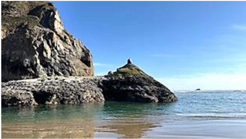
The Hug Point car path looking south.

cocktail bars and expensive small hotel/resorts. It's all a bit rich for our budget but if we had brought the trailer, we could have stayed at either of two campgrounds right in town which looked well-kept and were reasonably priced in the $50-60 range. Ten miles to the north the larger town of Seaside is more oriented to families on a budget. It has at least three campgrounds in the town, which is two more than Portland and three more than Seattle.