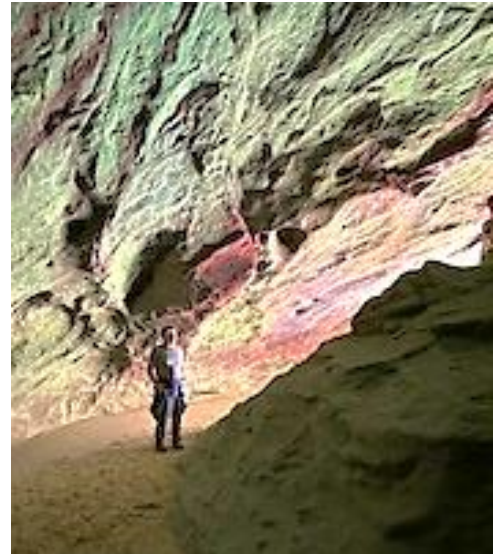
Sea cave at Hug Point with red algae growing on the ceiling. The cave is underwater at high tide.

We walked from the cottage to Hug Point State Park to explore some of the wave-dug caves that dot the base of the cliffs. One had an entire tree trunk jammed deep inside by a storm. At high tide, the cave is filled with seawater, and spectacular red algae grow on the cave ceiling.