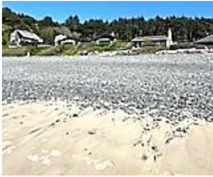
Beach at Arch Cape Oregon. Sand near the water, polished rocks above the tide line.

Upon reaching Portland we parked our trailer at a campground in the suburb of Gresham and spent much of the week with friends at their cottage on the Pacific coast at Arch Cape, Oregon, a hamlet of several dozen beach cottages and houses that line the shore just south of Hug Point State Park, about four miles south of the town of Cannon Beach.