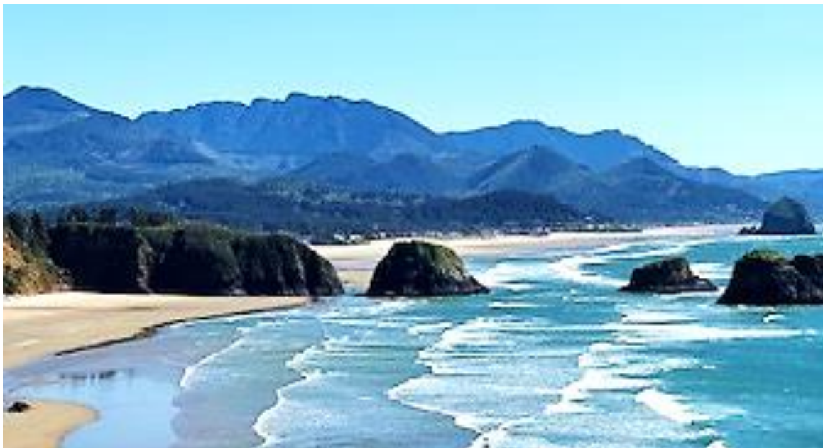
The Oregon shoreline at Indian Beach looking south from Ecola State Park to Cannon Beach beyond. Haystack rock is at far upper right. All the rocks are the eroded remains of lava flows from 350 miles to the east.