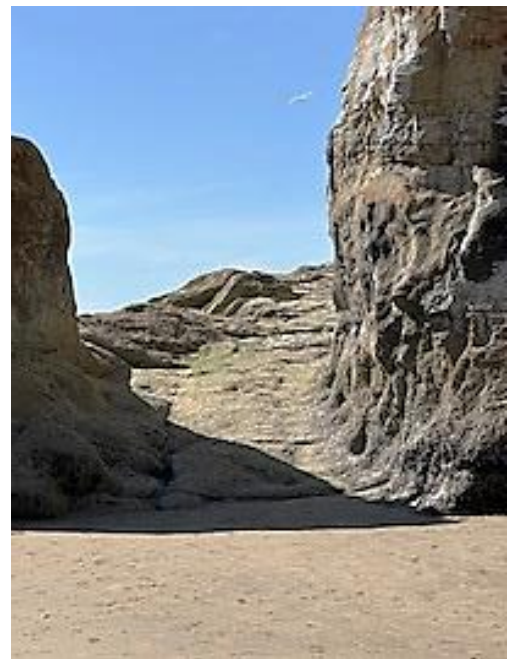
The hand-hewn car path looking North towards Cannon Beach. It is just wide enough for Henry Ford's Model T.