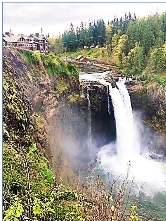
Snoqualmie Falls with Salish Lodge upper left. The intrepid can hike down to the bottom of the falls.

The week sped by and before we knew it, we were headed to Portland, less than four hours to the south. Although we had no rain during our Seattle stay, the mountains to the east (the Cascades) and west (the Olympics) were cloaked in clouds the entire time. On the way out of Seattle we had our one and only glimpse, from I-5, of Mount Rainier , the hulking volcano that looms over Seattle. Compared to the relatively sleek Mount Hood that is just east of Portland, Rainier's massive bulk makes Hood look almost petite, elegant.