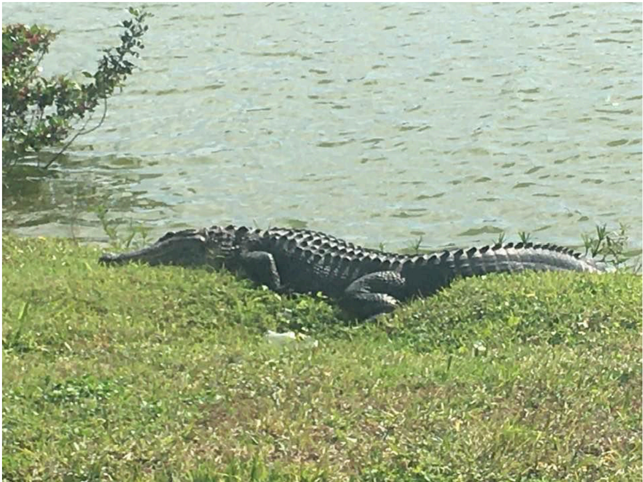
Photo of Thor lounging in our Venice, Florida back yard.

Spring has sprung and Summer is here. That means that our landscape is changing from barren Winter ground into green, grassy knolls. Also with the season comes various delights and hazards. Lightening bugs, newly hatched birds, flies, and mosquitoes are everywhere. In NC we watch our step for Copperheads, fire ants, dog bombs, and cacti. In Florida the game ramps up to the next level. Watch your step, Thor could be there.