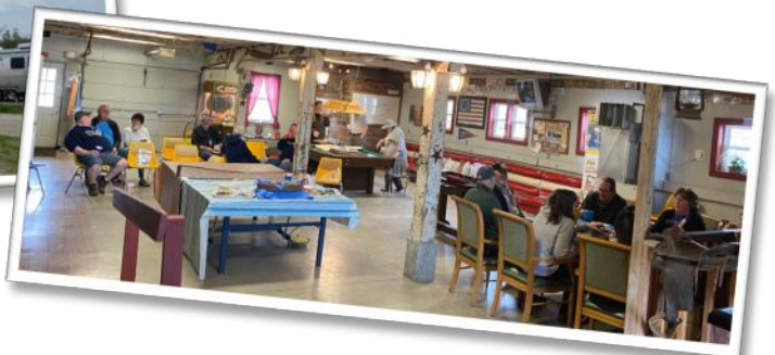
Photos from 2022 Mo-Kan Spring Rally