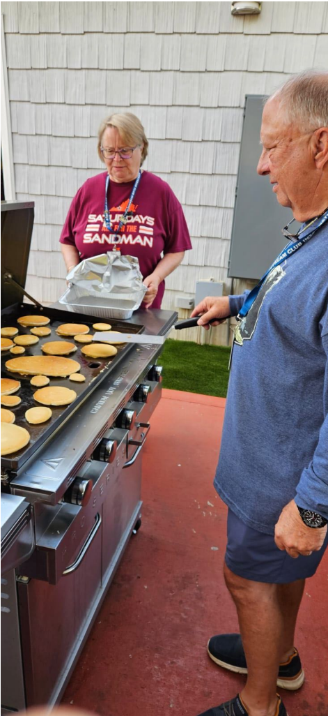
On of the BEST breakfasts ever!