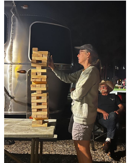
Jenga Into the Night - Tension!