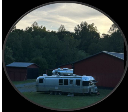
Arvin is BACK - YAY!