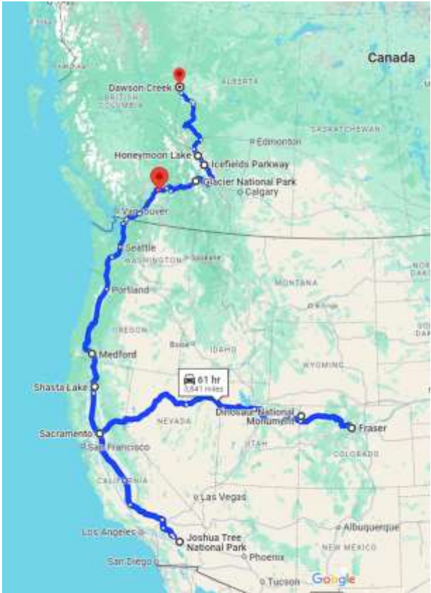
Our adventure before the Alaska Caravan.

As we were heading west, we were in contact with some friends on the Springtime in the Rockies caravan. We managed to get a campsite with them at Dinosaur National Monument Campground in Utah (4, 5) . This makes two years in a row that we ran into that caravan on the road. We had a great time meeting more Airstreamers on the road. Some of the folks we knew from other caravans; another couple was heading to the North to Alaska Caravan after the Rockies.