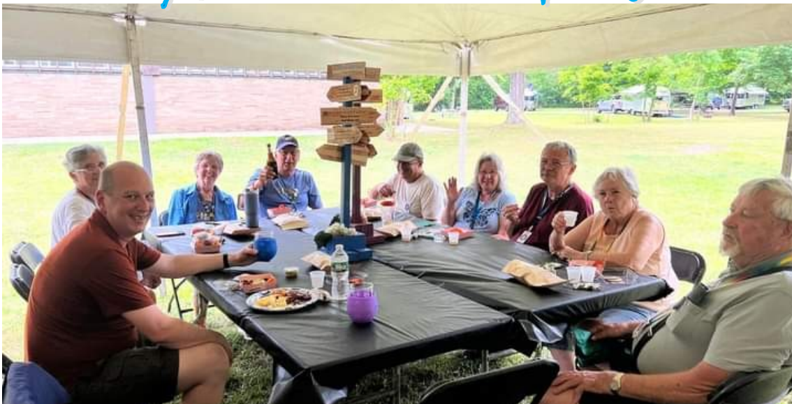
Hudson-Mohawk under the big tent for wine and beer tasting