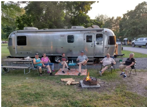
Campfire get together

We enjoyed coffee under the tent in the morning and food, wine/beer tasting, socializing and entertainment in the evening. There was a catered BBQ one night, charcuterie boxes to go along with the tasting another night. Sticks & Stone band treated us to two hours of a great mix of songs. Looked like everyone was having an awesome time!