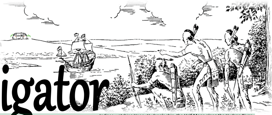
Indians watching Henry Hudson's ship, the Half Moon along the Hudson River