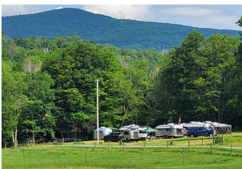
"Fun on the Farm Rally" July 2024

Sending sunshine, well wishes and happy thoughts to everyone!