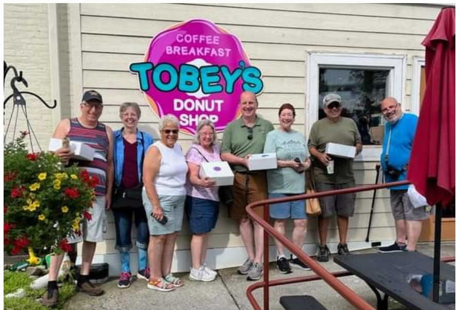
Road trip to get Tobey's Donuts, Yummy!!