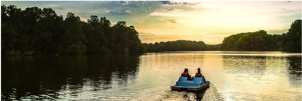
Lums Pond State Park.

The hosts and co-hosts will be arriving a day earlier, September 5, so please feel free to join them.