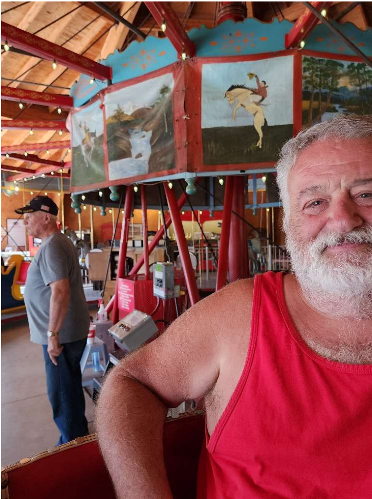
A 1913 hand carved wooden carousel which operated from May-September in Story City's North Park. This carousel was completed restored in 1982 and is one of 300 still operating. It is on the National Register of Historic Places.