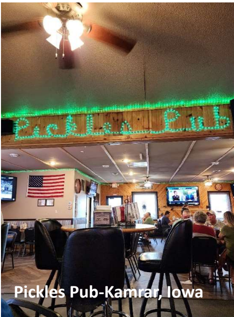
Pickles Pub-Kamrar, Iowa