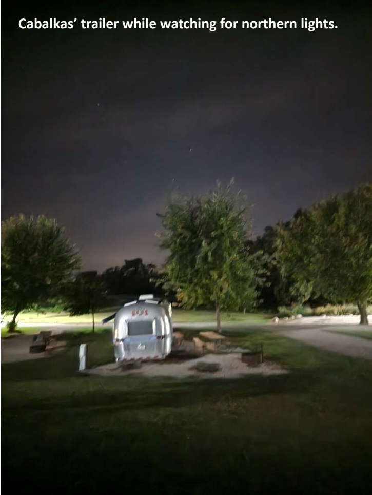
Cabalkas' trailer while watching for northern lights.