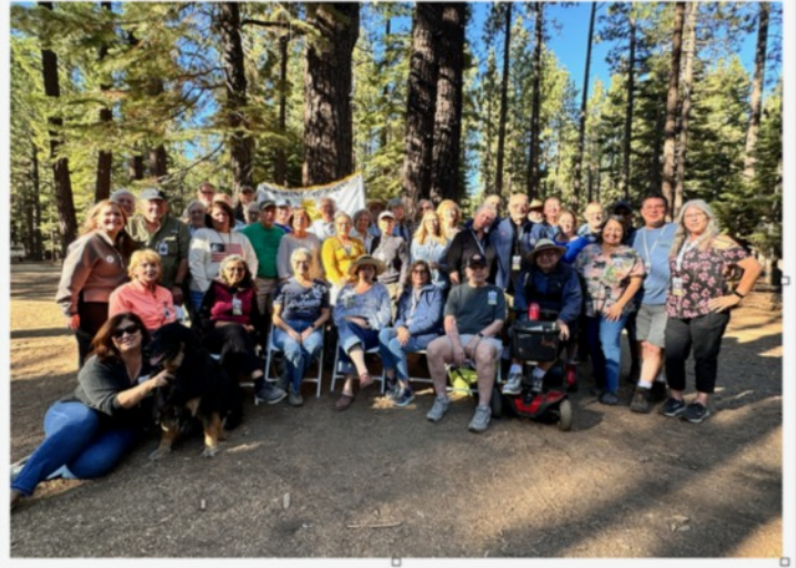
NorCal Members attending the Region 12 Rally

The rally sponsored a "Silver Soiree": a happy hour with appetizers provided by the region clubs. Our NorCal table was