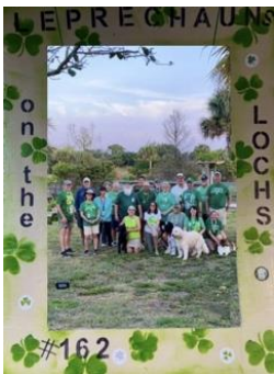
The whole crew

Here are just a few action shots of the Leprechauns