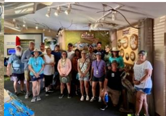
Getting a tour of the lock system