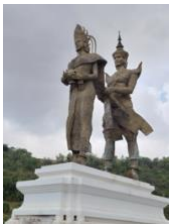
The Preah Thong and Neang Neakii statue symbolizes the birth of Khmer land, culture, traditions and civilization of Cambodia

Back to the Airstream, a haven so cool, The day's adventures by a refreshing pool. Nature's embrace, a soul's sweet release, This Florida life, brings perfect peace.