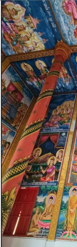
Kiri Sokharam Pagoda, very vivid, colorful pictures in the pagoda.

The added treat is getting massages for the body, feet, and head. Life is good.