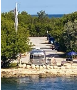
Camping at Bahia Honda