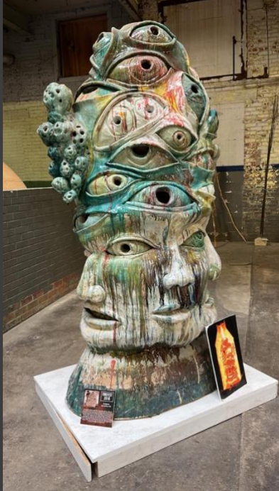
North Carolina Clay Mines - Clay Mines Documented by