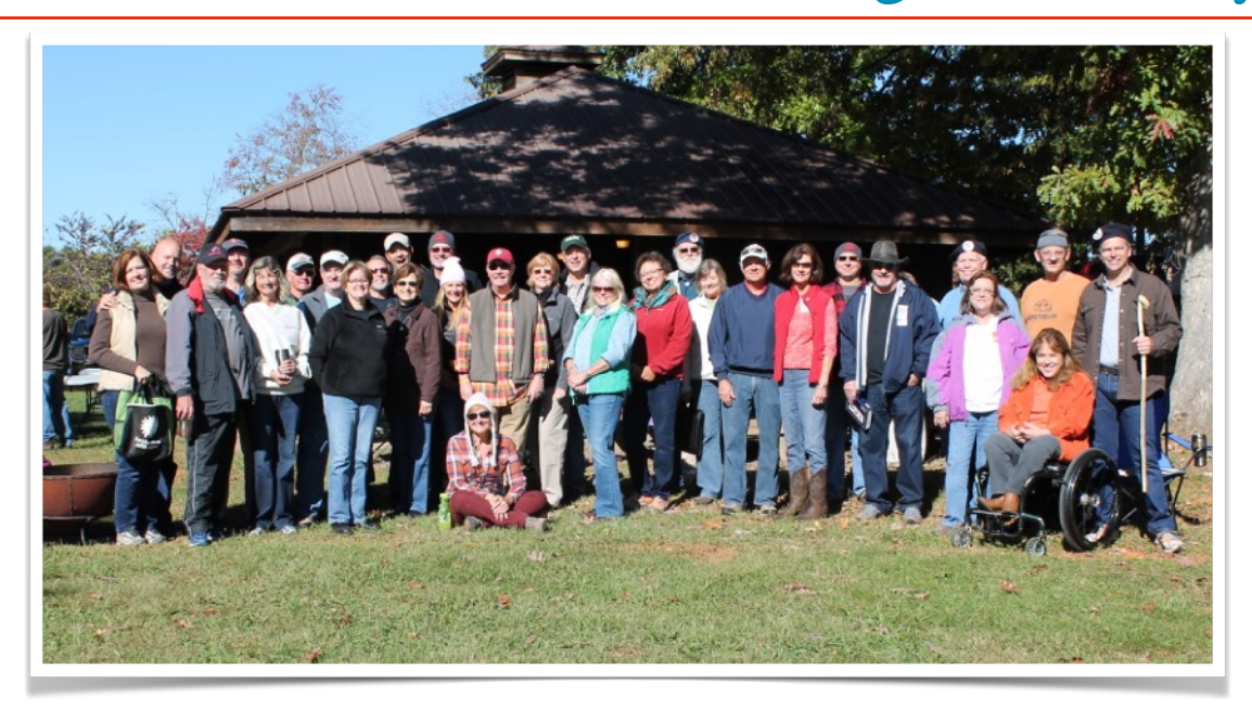
October 2014 Falluminum