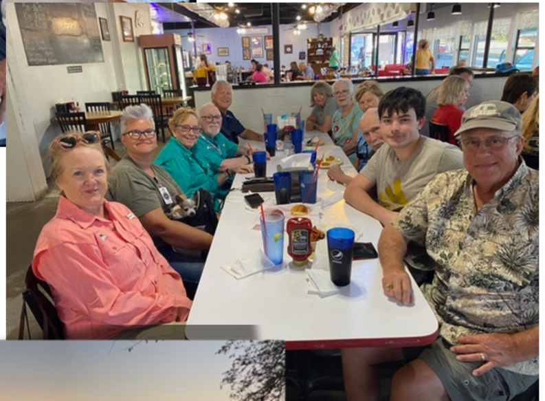
Mama's Home Cooking in Burnet, TX