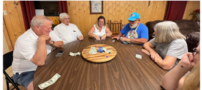
A fun game of L-C-R was played at the Rally