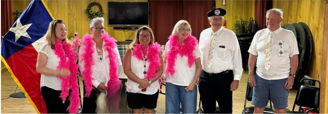
Your 2024-2025 Officers!