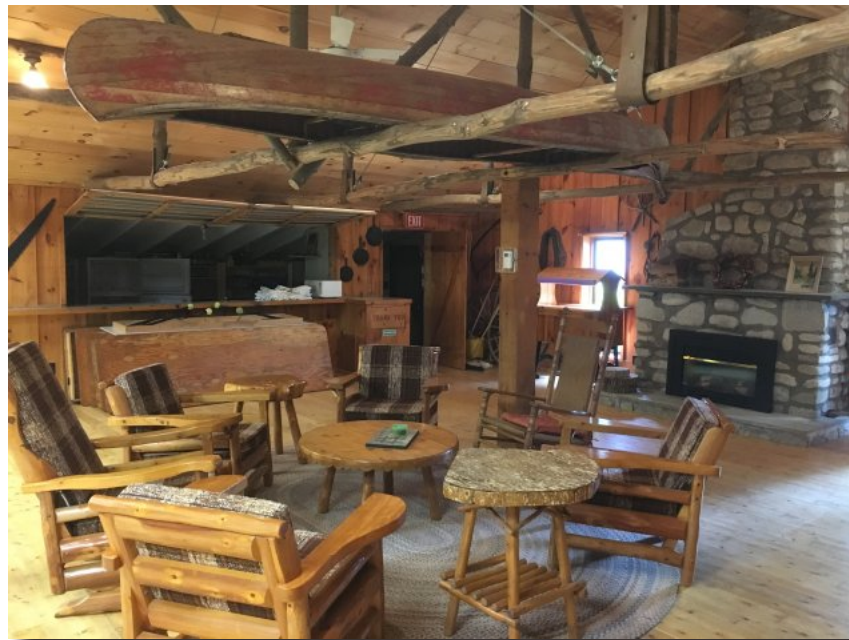
The Club Room at Summer House Park