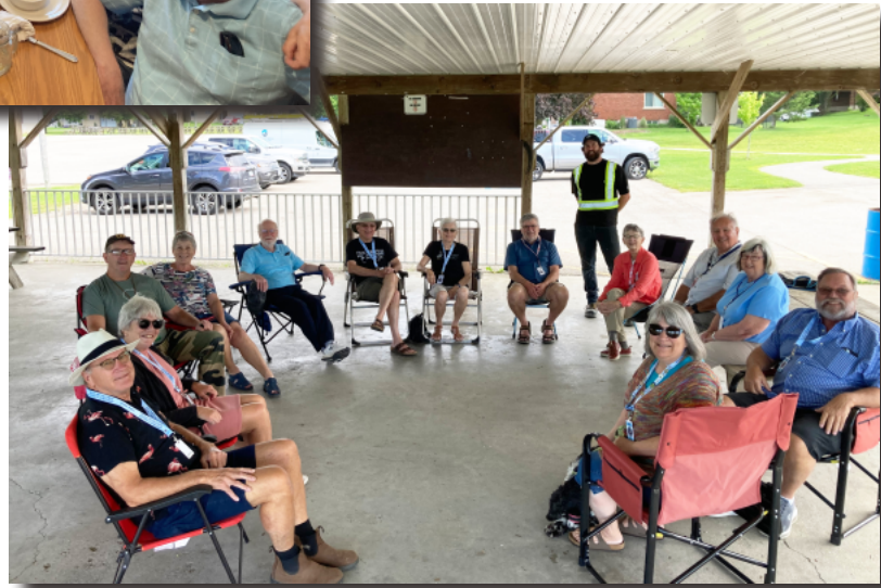
Where's the campfire?!