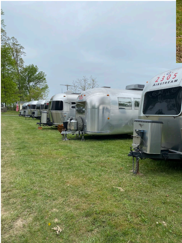
Charlie Michels' 60's vintage Airstream trailer, featuring a fully custom wooden interior