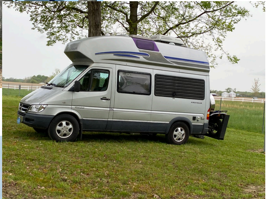
The Airstream / Sprinter / Westphalia Van