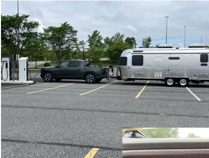
Charging at Christiana Mall

We got our new tow vehicle in December, an all-electric pickup (Rivian R1T). Our first test towing our 25 foot International Airstream was journeying to Waterville, PA from Lewes, DE. The Rivian R1T has a trip planner including fast charge locations, which it prioritizes based on user reviews.