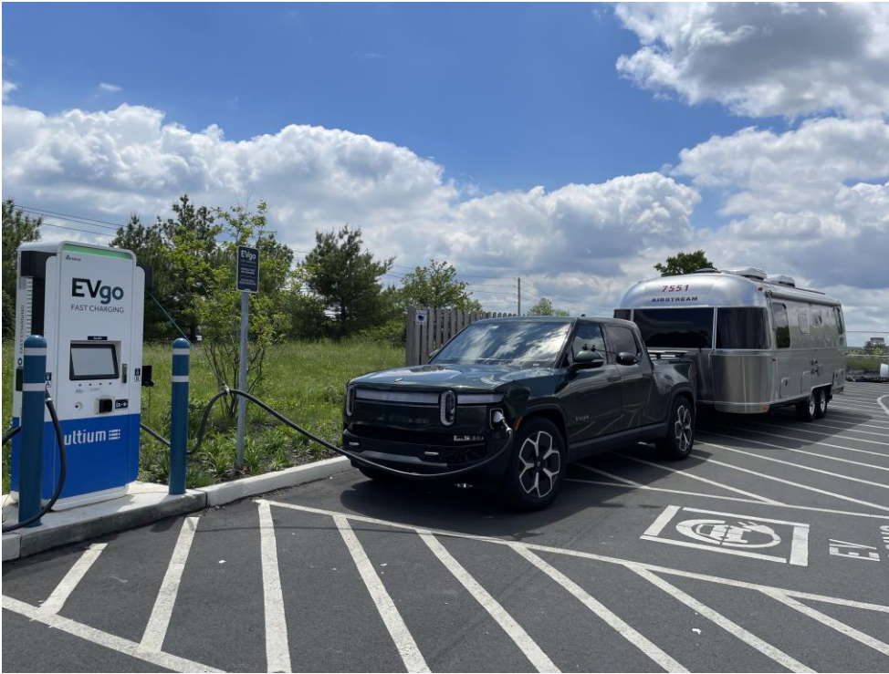
Charging at the Trexlerstown, PA Home Depot