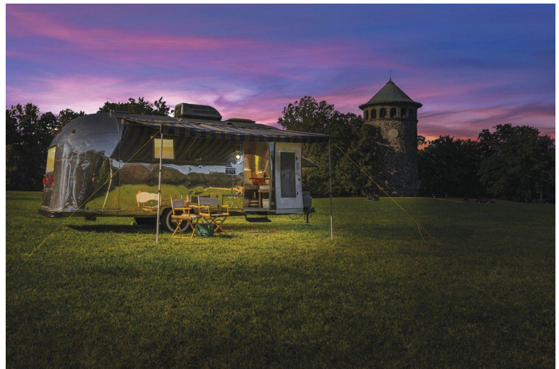
An Airstream Renovation Story See page 9 for the story

WBCI: Wally Byam Caravan Club International Inc.