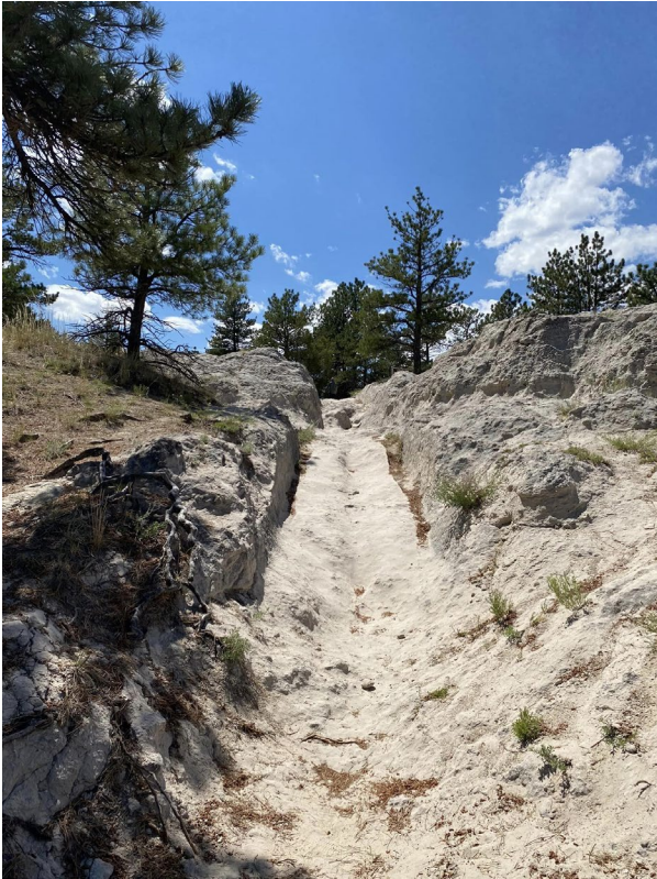
Oregon Trail Ruts State Historic Site, Guernsey, Wyoming.