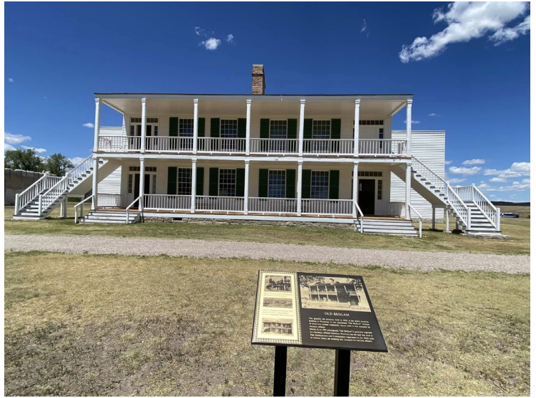
Officer's quarters, Ft. Laramie, oldest building in Wyoming

On July 10th, we crossed the Continental Divide. On July 11 th , we toured historic Ft. Bridger. Founded then abandoned by Mountain Man Jim Bridger, it was later a Mormon outpost then Army Fort. The Mormon, California Trails and Pony Express all passed through here.