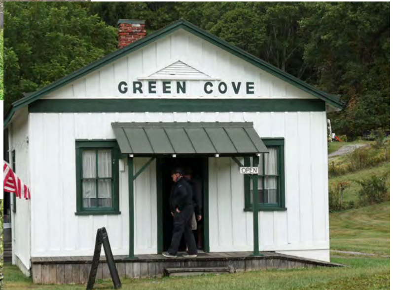
Green Cove Station, just down from White Top

The September 18 th adventure was a bicycle ride from White Top Mountain to Damascus, VA - 17 miles, almost all downhill. Here is the bicycle gang ready to depart from White Top. This is truly one of the most beautiful Rails to Trails rides in the country.