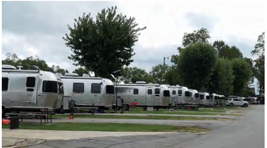
Shiny Hineys all in a row See the Smidge of the Blue Ridge Caravan article starting on page 6

WBBCI: Wally Byam Caravan Club International Inc.