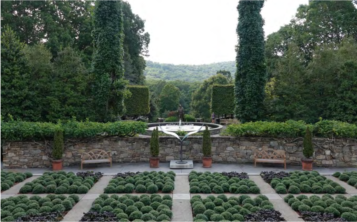
Recently planted mums (and not yet blooming) Fall quilt garden at the Arboretum

September 16th was a free day since we opted not to go on the waterfall hike. We visited the North Carolina Arboretum in the morning to see the birds, trees, & flowers. The birds were a bit scarce but there were plenty of trees and flowers. A lovely place that we visited many years ago and wanted to see again