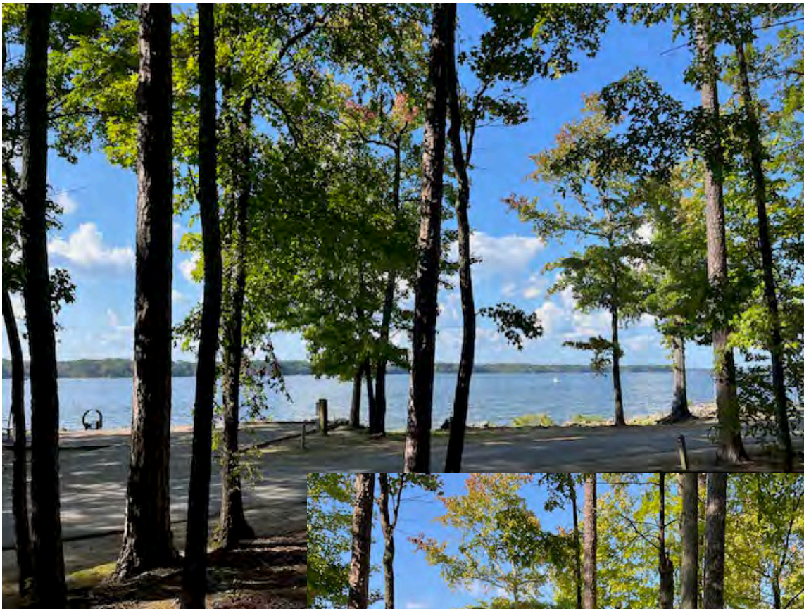
View from our campsite in Bullocksville State Park. What a beautiful location.

We departed the caravan on September 20 th and made one stop on the way back home. We camped at the Bullocksville State Park on the Kerr Lake Reservoir and NC State Recreation Area, located west of Interstate 85 just south of the Virginia state line. A very nice campground, state parks are always our first choice.