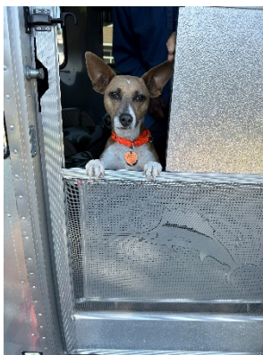
Cricket popping her head out to see which state the Airstream is parked in today.

As some of you may have heard, we stopped on our trek west to buy a house in Tennessee! That's right, we've decided to pull the trigger and buy an RV home in the beautiful Cumberland Plateau at The Gardens RV Village Homes in Crossville, TN. We've had our eye on this community for a while and decided the time was right. While we are excited about this down-sizing move to Region 6 (no more barn stalls to muck, pastures to bush-hog, board fences to paint, etc.), it will be difficult to say goodbye to our many treasured Region 3 friends here in the Virginia/DC/Maryland area. That just means we'll be even more excited to see you at future International Rallies, National Events and forthcoming Airstream Caravans wherever they may take us.