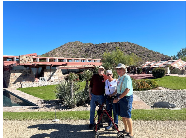
Fun with friends at Frank Lloyd Wright's winter home, Taliesin West, in Scottsdale, AZ.

As some of you may have heard, we stopped on our trek west to buy a house in Tennessee! That's right, we've decided to pull the trigger and buy an RV home in the beautiful Cumberland Plateau at The Gardens RV Village Homes in Crossville, TN. We've had our eye on this community for a while and decided the time was right. While we are excited about this down-sizing move to Region 6 (no more barn stalls to muck, pastures to bush-hog, board fences to paint, etc.), it will be difficult to say goodbye to our many treasured Region 3 friends here in the Virginia/DC/Maryland area. That just means we'll be even more excited to see you at future International Rallies, National Events and forthcoming Airstream Caravans wherever they may take us.