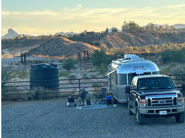
Peaceful Hip Camping for a few days at a calf-roping ranch in the hills of Arizona.