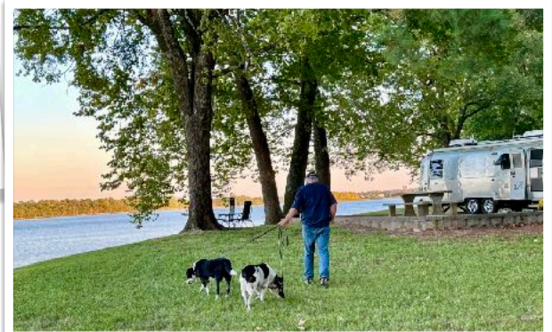
Little Rock, AR