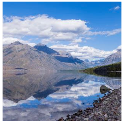
Glacier Natl Park