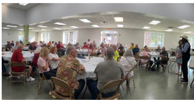
Region 12 dinner