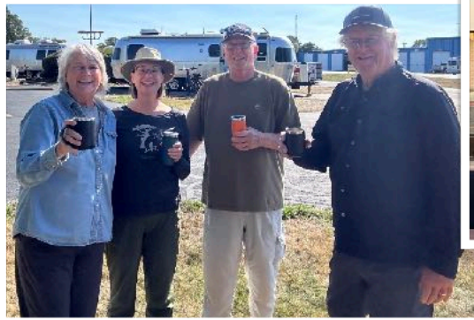
Jackson Center, OH