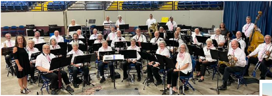
International Club's all-volunteer band