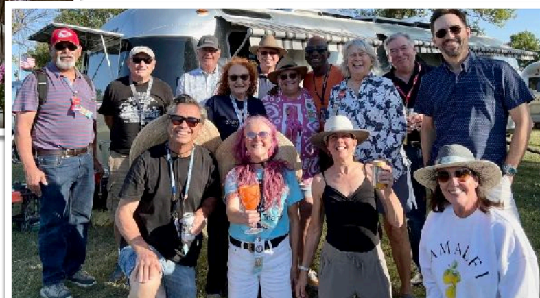
Greater Los Angeles Airstream Club is in the house!