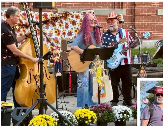
The Lost Lug Nuts