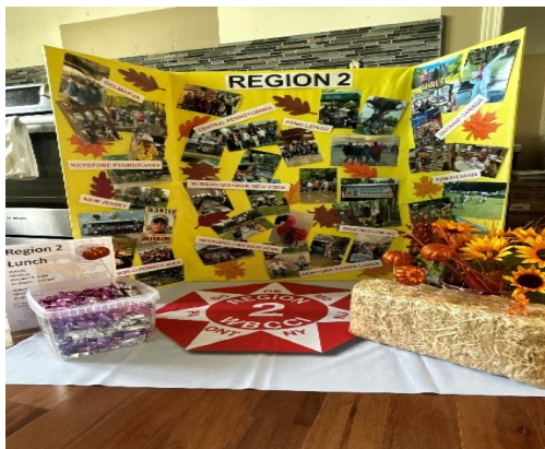
The Region 2 table at the International.