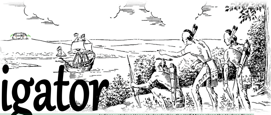
Indians watching Henry Hudson's ship, the Half Moon along the Hudson River