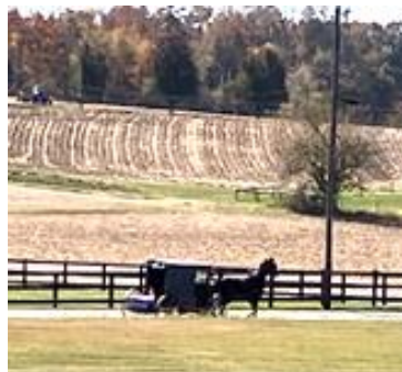
A horse and buggy drives past the White Oak Campground.