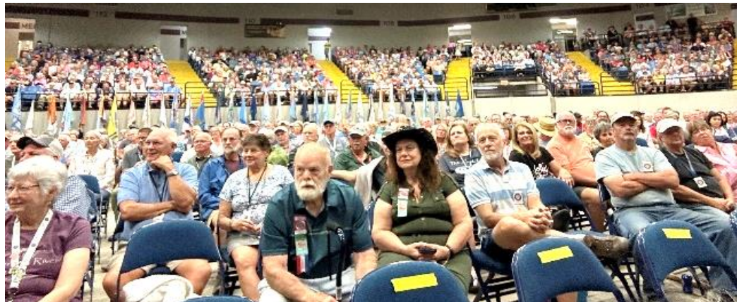
Forty-four percent of the attendees were first timers.

sausage, potato salad, baked beans, and cookies. There were gallons of sweet, unsweetened tea, along with pink lemonade. The final count was 150 people and no one left hungry from the room!