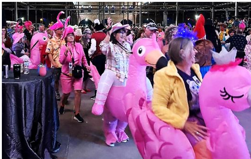
As always, the Vintage Airstream Intraclub had a wild and crazy night event to match the October theme. Who would have guessed what the most popular costume at an Airstream event would have been???