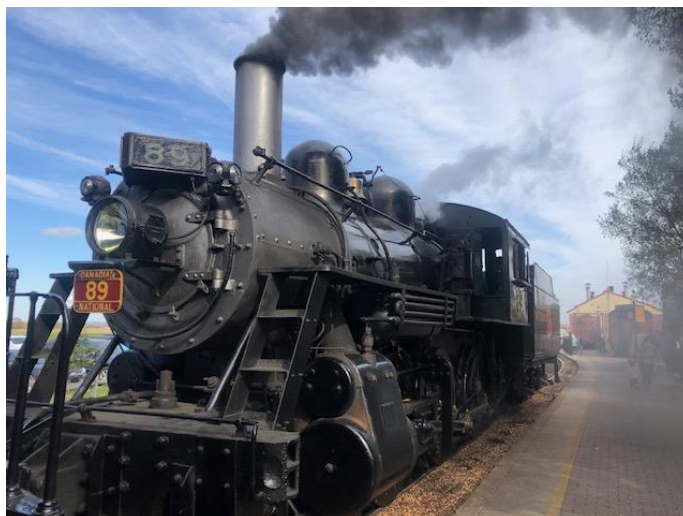
Strasburg Railroad steam engine enters the station.