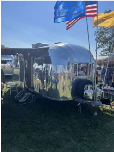
on October 30th for York, PA.