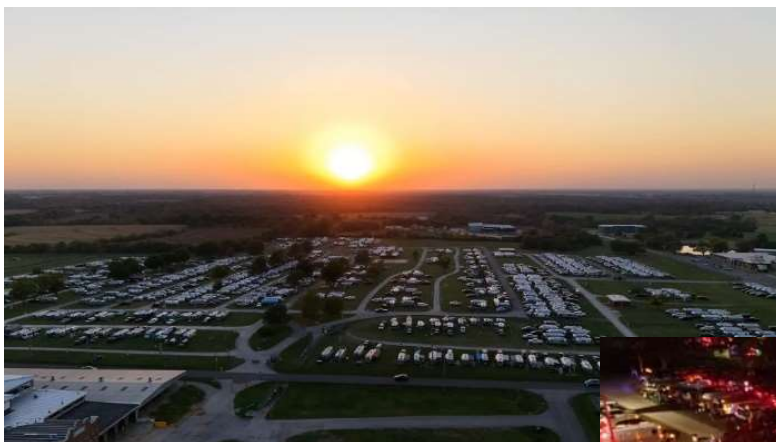
View above the Iowa Airstream club during Airstream Aglow