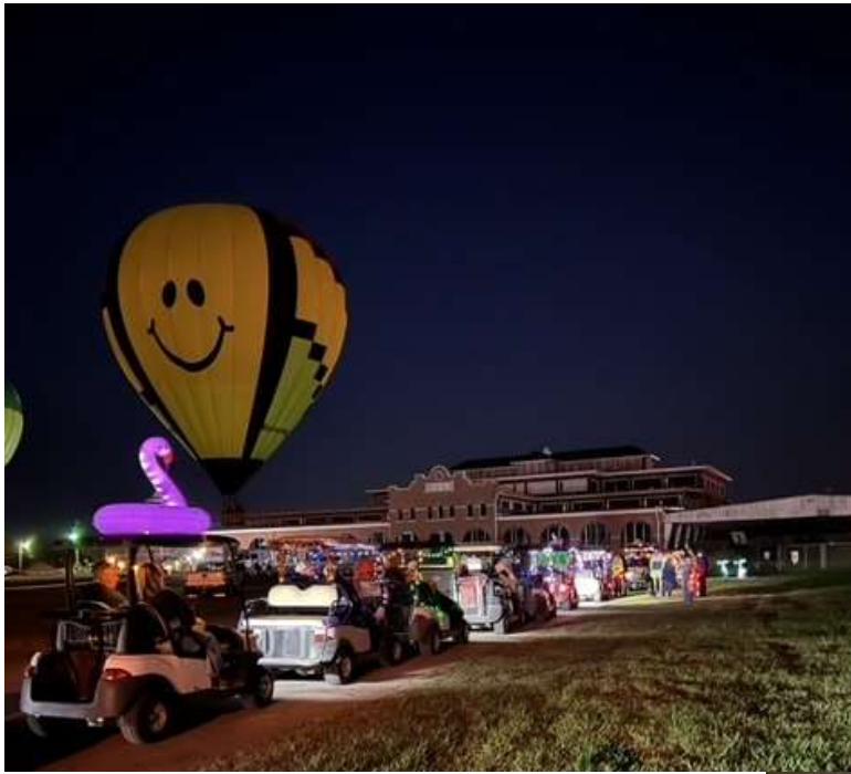
Airstream Aglow parade and balloon flights