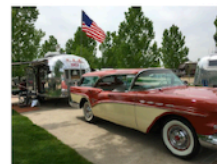
When I was a kid, I would see these Airstreams with Big Red Numbers come through my town and would dream of owning one someday. Today is the someday!!!