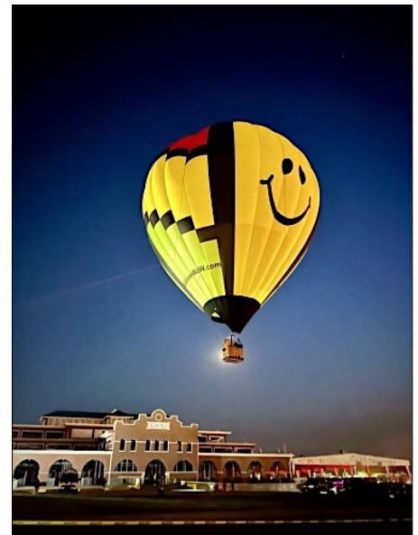
Hot Air Balloon over the beautiful brick Swine Building.