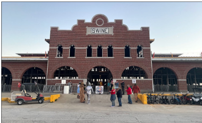
The Swine Building.