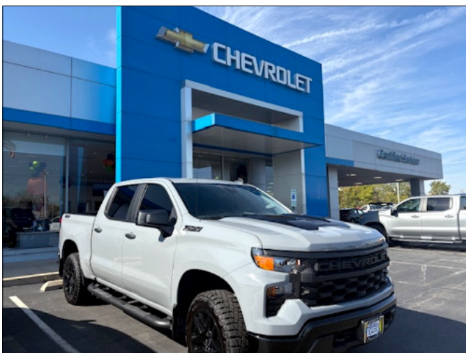
New Tow Vehicle

For those of you still getting out or headed to warmer climates, safe travels! And for those of you winterizing, check out Russ's Winterizing Tips! The link is included in the Chatter.