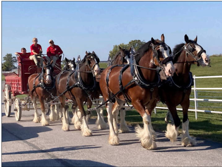
Clydesdale team in training at the ranch.