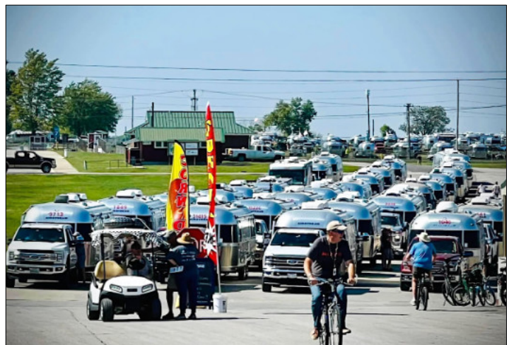
The parking crew.