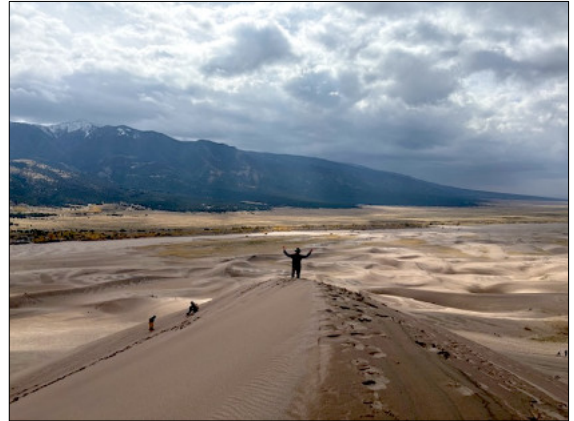
Billy at Great Sand Dunes

Great Sand Dunes was amazing! It is one of our newer National Parks designated in 2004. However, it was established as a National Monument in 1932. We were able to camp in the park and could walk out from the campsite to hike the dunes. There are no trails, you just pick your path and go. We scaled some of the larger dunes making it up to 8550 feet in windy conditions. We also enjoyed our time in Santa Fe with our boys wandering around the shops and going to several museums.